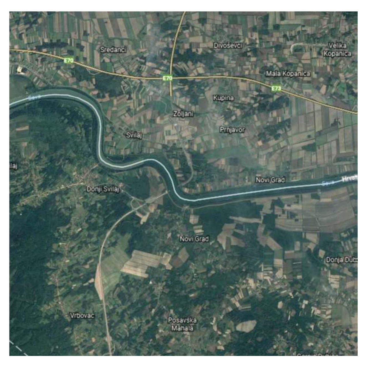
Figure 3.2 A5 from A3 to the state border with Bosnia and Herzegovina (TEN-T comprehensive network/Pan-European corridor Vc) (Svilaj bridge)